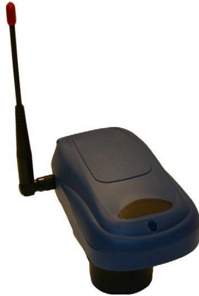
Prophet with integrated Ultrasonic Sensor